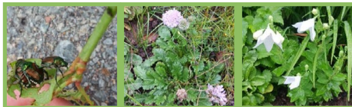
Japanese beetles, pincushion flower, balloon flower (left to right)

Many of us attended the NSAGC convention at MSVU and the Fall Rally. We made the Fall Rally our September meeting. Both were a great opportunity to meet gardeners from other clubs and get fresh ideas.