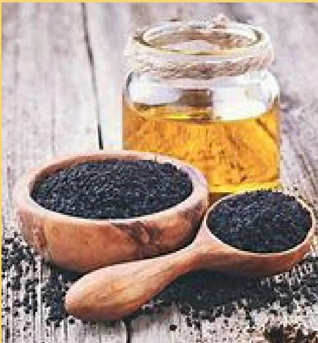
Black cumin seed and black cumin seed oil

We're looking forward to sharing our Christmas photos with you in the next edition of our newsletter. In the meantime we wish you happy holidays and all the best in the New Year!