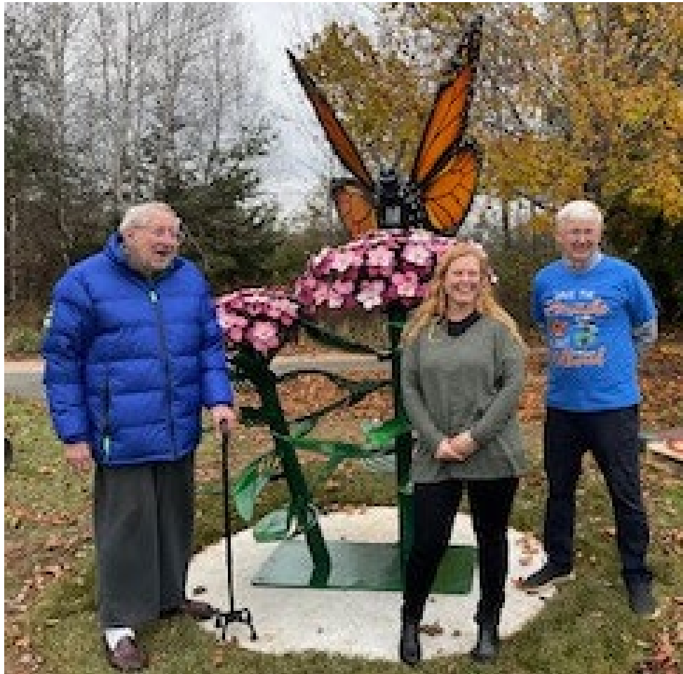
Obviously delighted with this wonderful work of art, club members are shown with the artist. The whole community supported this project and hope that this installation will raise people's awareness to the plight of the Monarch. They anticipate that highlighting the food source for the Monarch will encourage people to plant milkweed—with its beautiful blooms—in their gardens.

This sculpture is a symbol of our need to care for the environment as the Monarch relies on only one plant for survival—the milkweed which produces a chemical toxic to butterfly predators, but not to the Monarch. Unfortunately, there is a shortage of milkweed in the province.