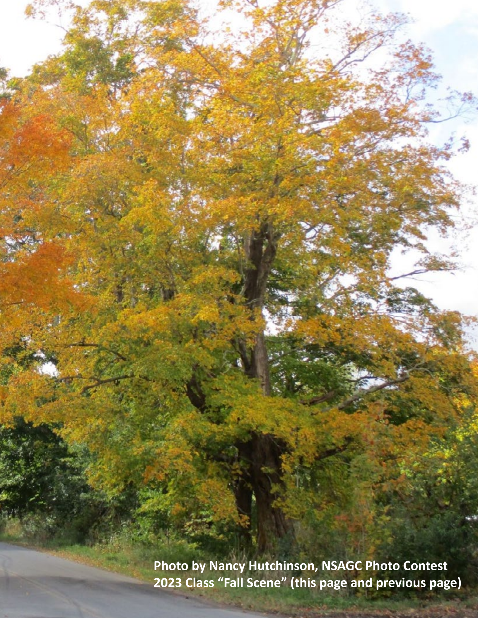
NSAGC Photo Contest 2023 Class "Fall Scene" (this page and previous page)