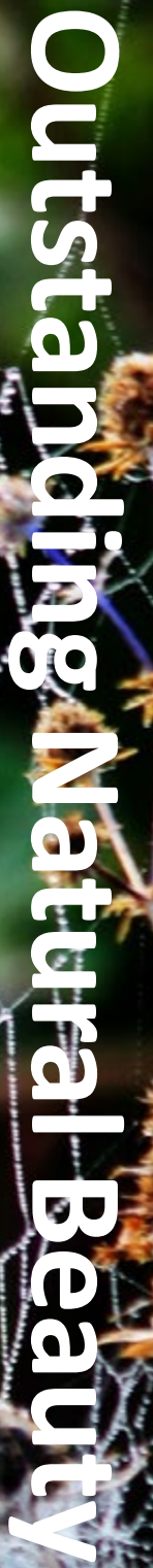
Photo by Jennifer Hill, NSAGC Photo Contest 2023 Class "Garden Art"