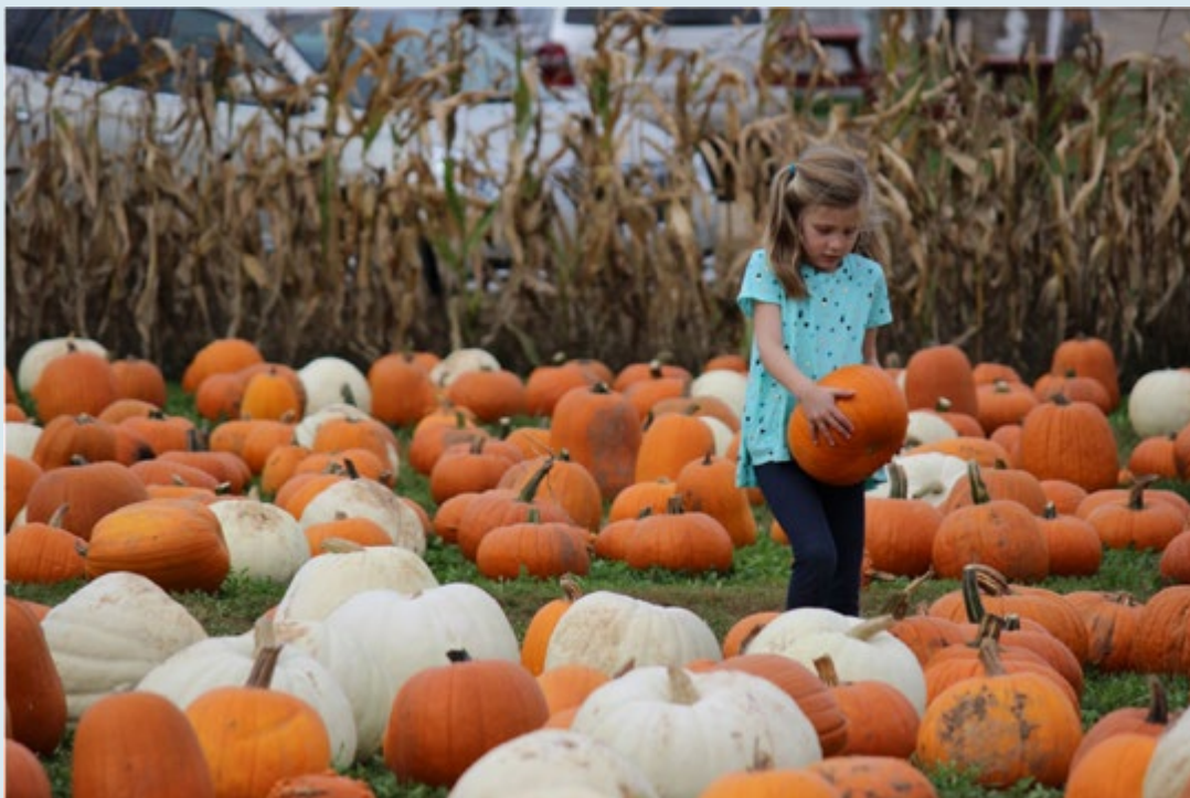
NSAGC Photo Contest 2023 Third in Class "Fall Scene"