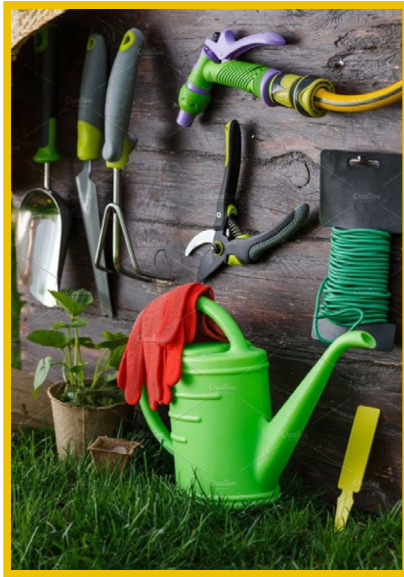
Club members suggested favourite tools for a municipal garden tool lending library project.

this may end up being a bigger project than the coordinator thinks and we'll have to see where this takes us. We have created a "Kids Gardening Club" committee and it may be something they can run with. Either way, we are happy that the Municipality is reaching out to us to make the community link. (continued on following page)