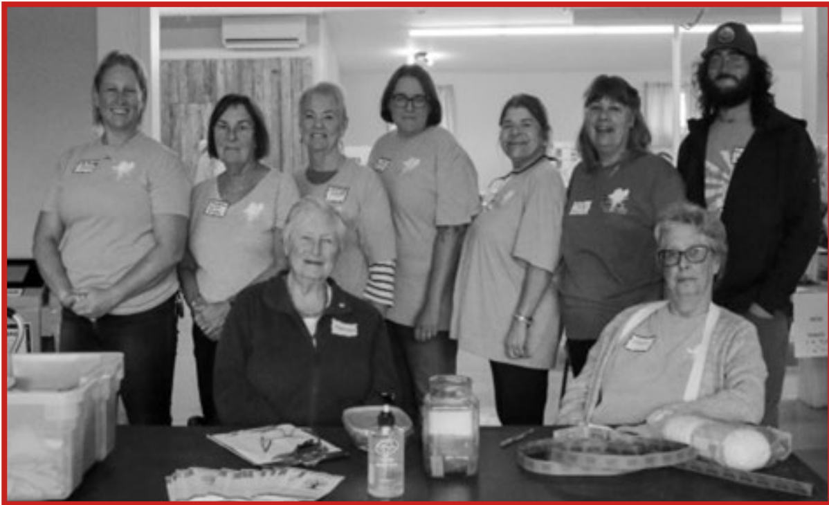
The Stewiacke Garden Club team warmly welcomes members from clubs in District Three North and South.

The Musquodoboit Valley Weeders, Stewiacke Valley and Stewiacke Garden Clubs joined to host a wonderful afternoon for all 12 clubs in District Three North and South. The theme was “Growing Our Future.” The opening remarks, given by the chairperson, began with an energetic cheer to celebrate finally having our first post-Covid Fall Rally.